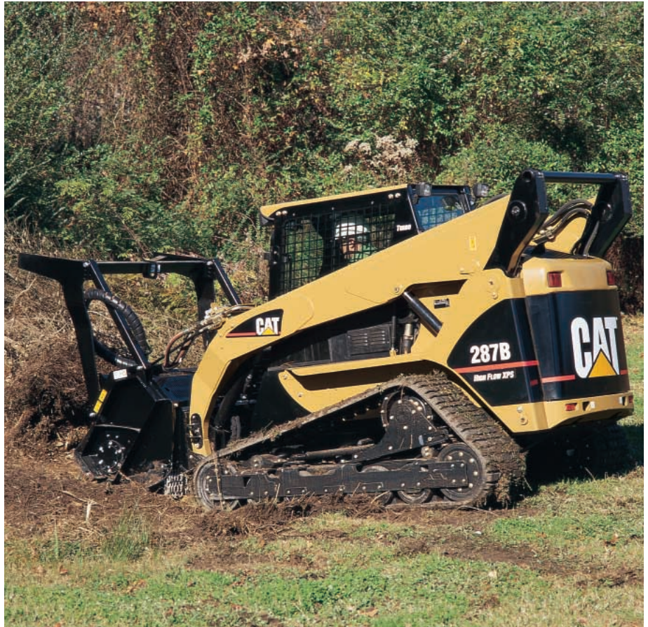
Powerful and Reliable

Reliability and Cleanliness. Hydraulic system reliability and cleanliness are improved by using single components in place of multiple components, such as the monoblock hydraulic valve and monoblock pumps. Fewer leak points improve reliability and result in a cleaner machine. In addition, hydraulic oil flows through a 5-micron spin-on filter. A filter restriction indicator is located in the operator station. A 74-micron screen in the hydraulic tank prevents larger debris from entering the system and causing damage to the hydraulic components.