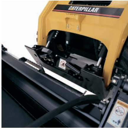
Optional Quick Coupler

Choose from a wide variety of tools that are performance matched to the Cat Multi Terrain Loader.