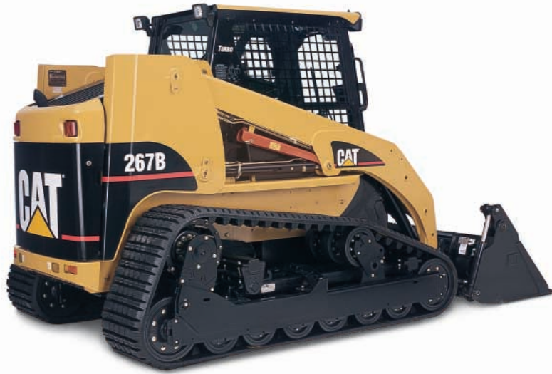
Rubber Track Undercarriage

The unique rubber track undercarriage provides low ground pressure, stability, high traction, fast travel and suspension.