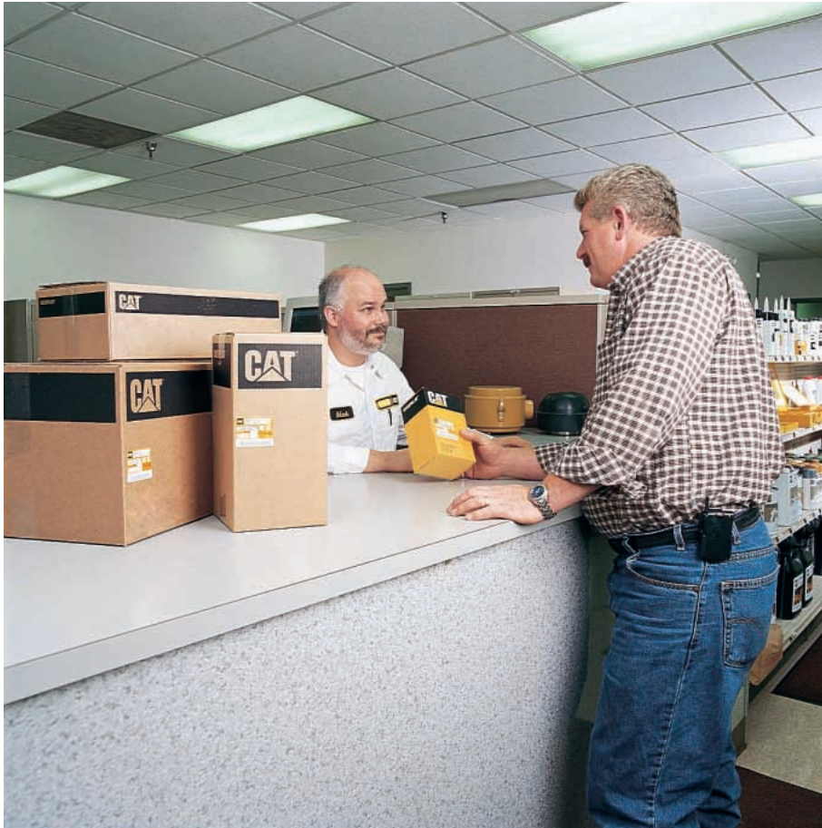
Worldwide Parts Availability

Cat dealer services help you operate longer with lower costs.