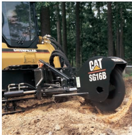
Cat SG16 Stump Grinder

An optional hydraulic quick coupler is also available and allows engagement and disengagement of work tools without the operator needing to exit the machine. Control of the coupler by use of a rocker switch inside the cab makes work tool changes quicker and easier.